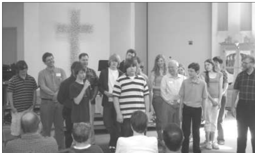
Bear Creek UMC Confirmation—June 2007

Year-to-date Ahead/(Behind) ($13,356) -8.7%